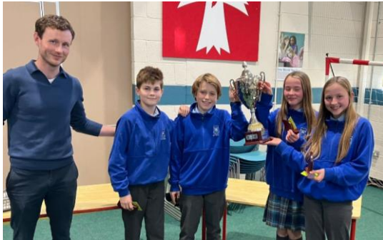
The Oatlands Team - Winners

We would like to congratulate the Oatlands team on their wonderful achievement but also extend a huge congratulations to all the boys and girls who took part. It is such an honour for all of them to represent their school at such an elite level and we hope they enjoyed the day.