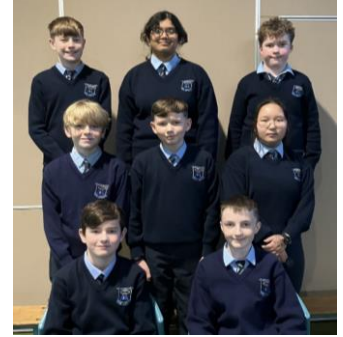
St. Attracta's SNS Team