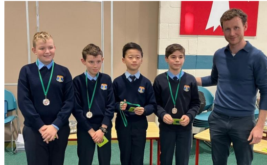
St. Olaf's Team - 2 nd Place